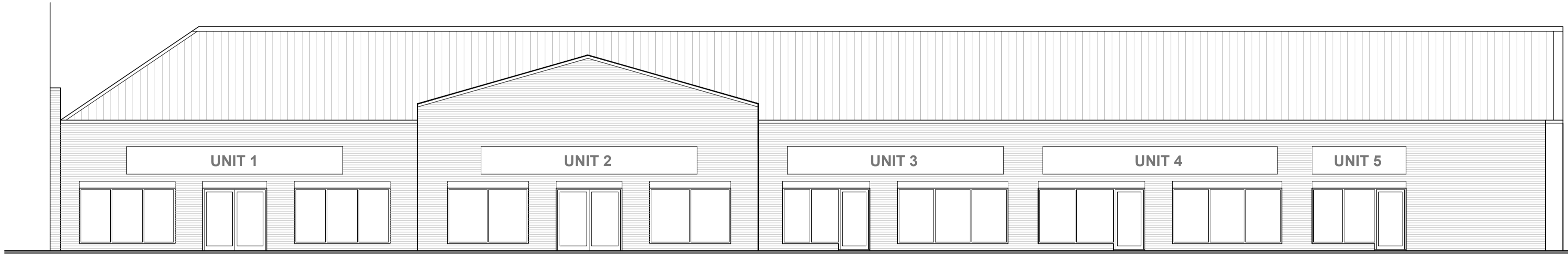
FRONT ELEVATION 1:100 @ A1